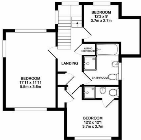
1ST FLOOR APPROX. FLOOR AREA 688 SQ.FT. (63.9 SQ.M.)

TOTAL APPROX. FLOOR AREA 1635 SQ.FT. (151.9 SQ.M.)